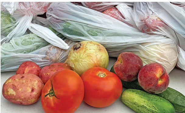
An abundance of local produce from the Black Farmers Hub

Nothing says summer like fresh produce! Thanks to three generous grants from 4 Others Foundation, the Tom and Pat Gipson Fund of the Triangle Community Foundation, and UNC Rex Foundation, our seniors received an abundance of locally grown produce and other delicious products. Our staff worked with the Black Farmers Hub, The Produce Box, Whitfield Farms, Natures' Cup, and Beehive Yourself to obtain locally produced products.