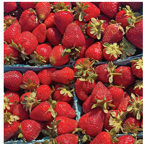
Tasty strawberries from Whitfield Farms

provides the crucial fiber and nutrients needed in a healthy diet for seniors. According to the CDC, eating a diet rich in fruits and vegetables can help reduce the risk of many leading causes of illness and death. For older adults, cost, limited availability and access, and a lack of ability to prepare food can be barriers to proper fruit and vegetable consumption. Thanks to the generosity of our supporters, we will continue to ensure that our seniors have access to the fresh produce they need to live their healthiest, and most nourished lives.